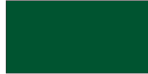
137 FOREST GREEN