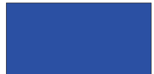
208 SAFETY BLUE

The above color samples are approximations which are affected to some degree by lighting and the age of the color card itself. Occasionally there may be a slight variance between the color card and the actual painted surface for these reasons. Always apply a test patch for approval prior to product application.