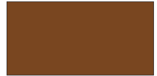
153 SONORA TAN