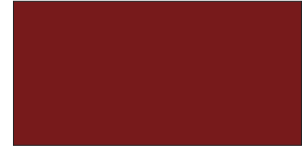
139 RUSTIC RED