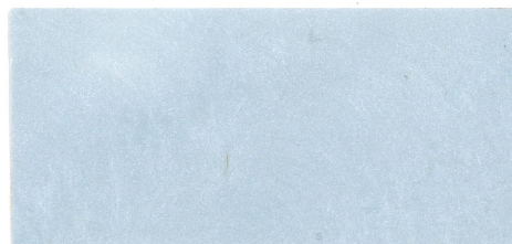
Pearl Base Color: Sky Blue

-Dry Time: Allow 7-9 hours of dry time before applying the 3rd coat (do not exceed 18 hours). Ideally apply the third coat while the second coat is tacky.